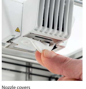
x10 Replacement covers keep your print head in top condition