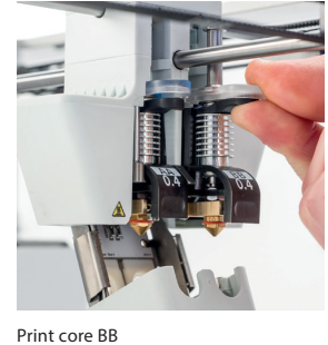
0.4, 0.8 mm Specially designed for printing soluble support material